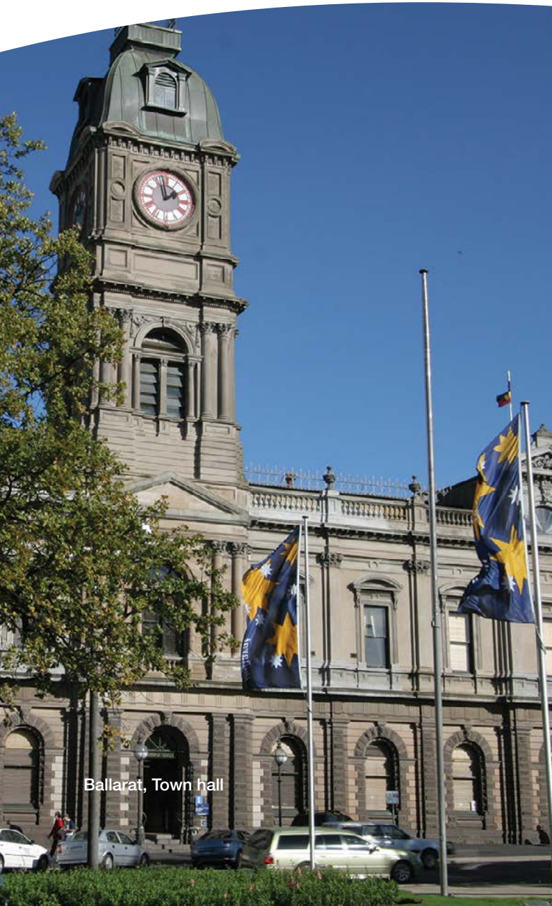
Ballarat, Town hall