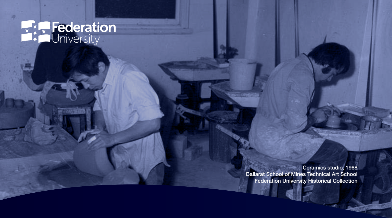
Ceramics studio, 1968 Ballarat School of Mines Technical Art School Federation University Historical Collection